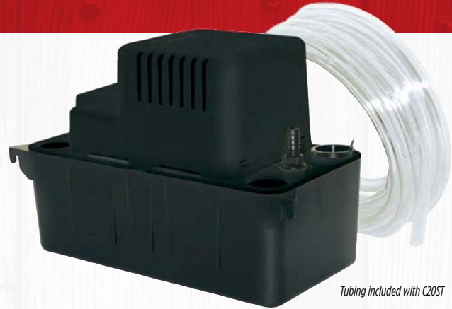
Tubing included with C20ST