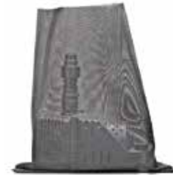
ProLine Hy-Drive inside of Pump Bag