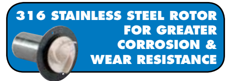
316 STAINLESS STEEL ROTOR FOR GREATER CORROSION & WEAR RESISTANCE