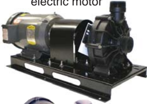
Long coupled to electric motor

Consult factory for models with materials of construction other than EPDM and polyester as shown below.