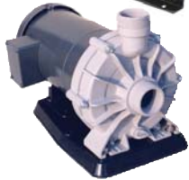
Close coupled electric

* 5 HP single phase motor is 230 volt only. Consult factory for 50 Hz motors and performance