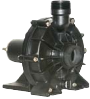
Pedestal mounted for Long coupling

* 5 HP single phase motor is 230 volt only. Consult factory for 50 Hz motors and performance