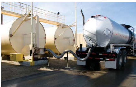
Tank truck unloading.

Impeller numbers are indicated on curve. NOTE: pump performance is slightly greater with engine drive (3600 rpm) See chart on next page.