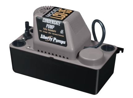
Model LCU-15 (115V) Model LCU-15S (115V) Model LCU-15T (115V) Model LCU-15ST (115V)