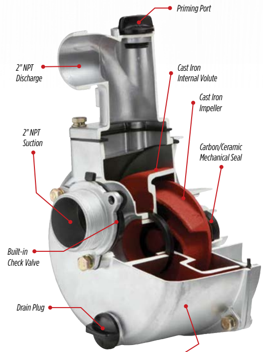
Lightweight Aluminum Pump Housing